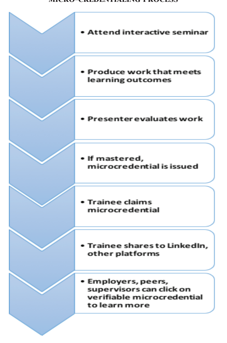
FIGURE 1. STEPS IN THE MICRO-CREDENTIALING PROCESS

learning outcomes that students can expect to achieve by attending the seminar. Presenters are coached to provide opportunities for active learning during the seminar, including think-pair-share exercises, reflective writing, and other high impact pedagogical practices.